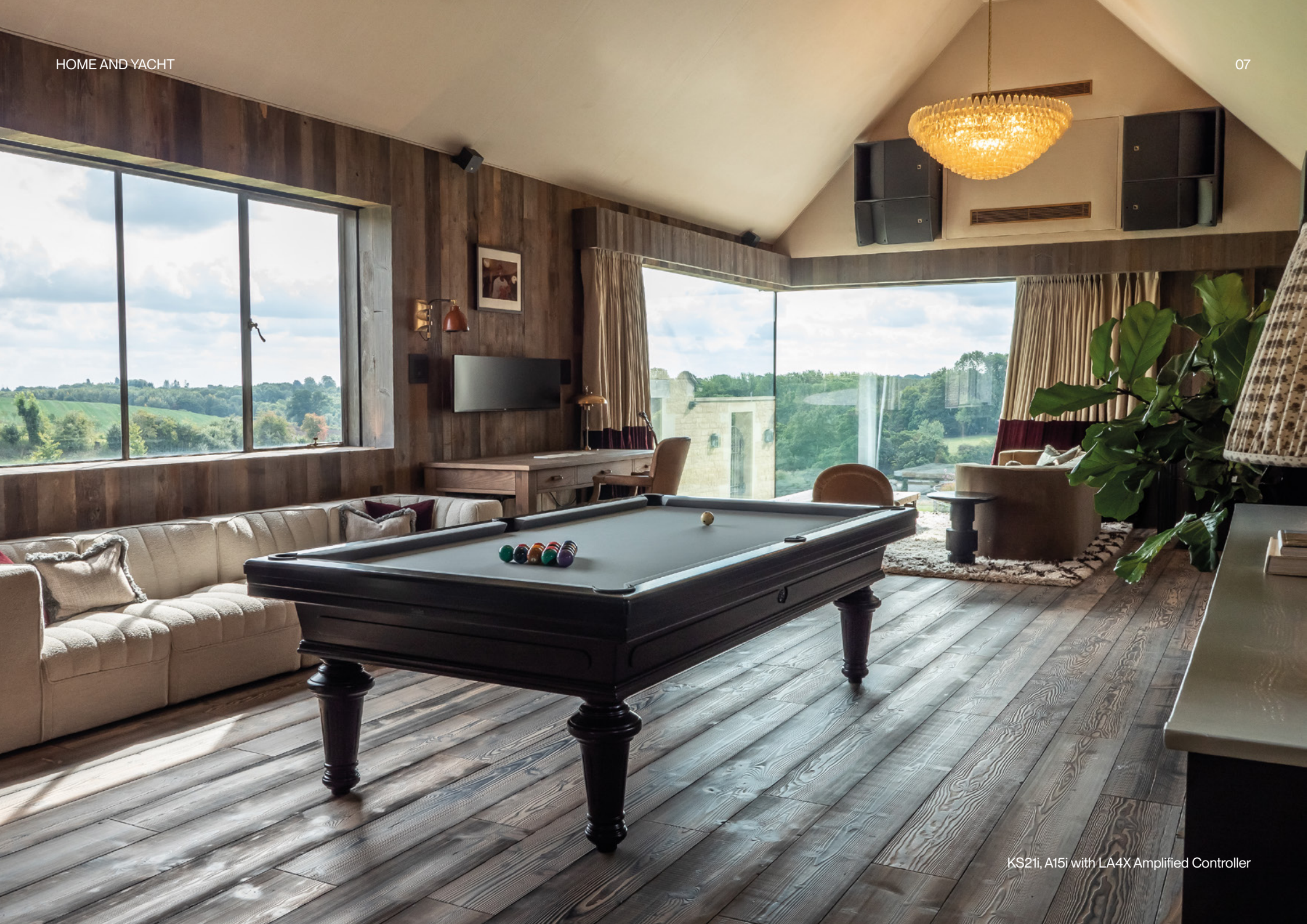
KS21i, A15i with LA4X Amplified Controller