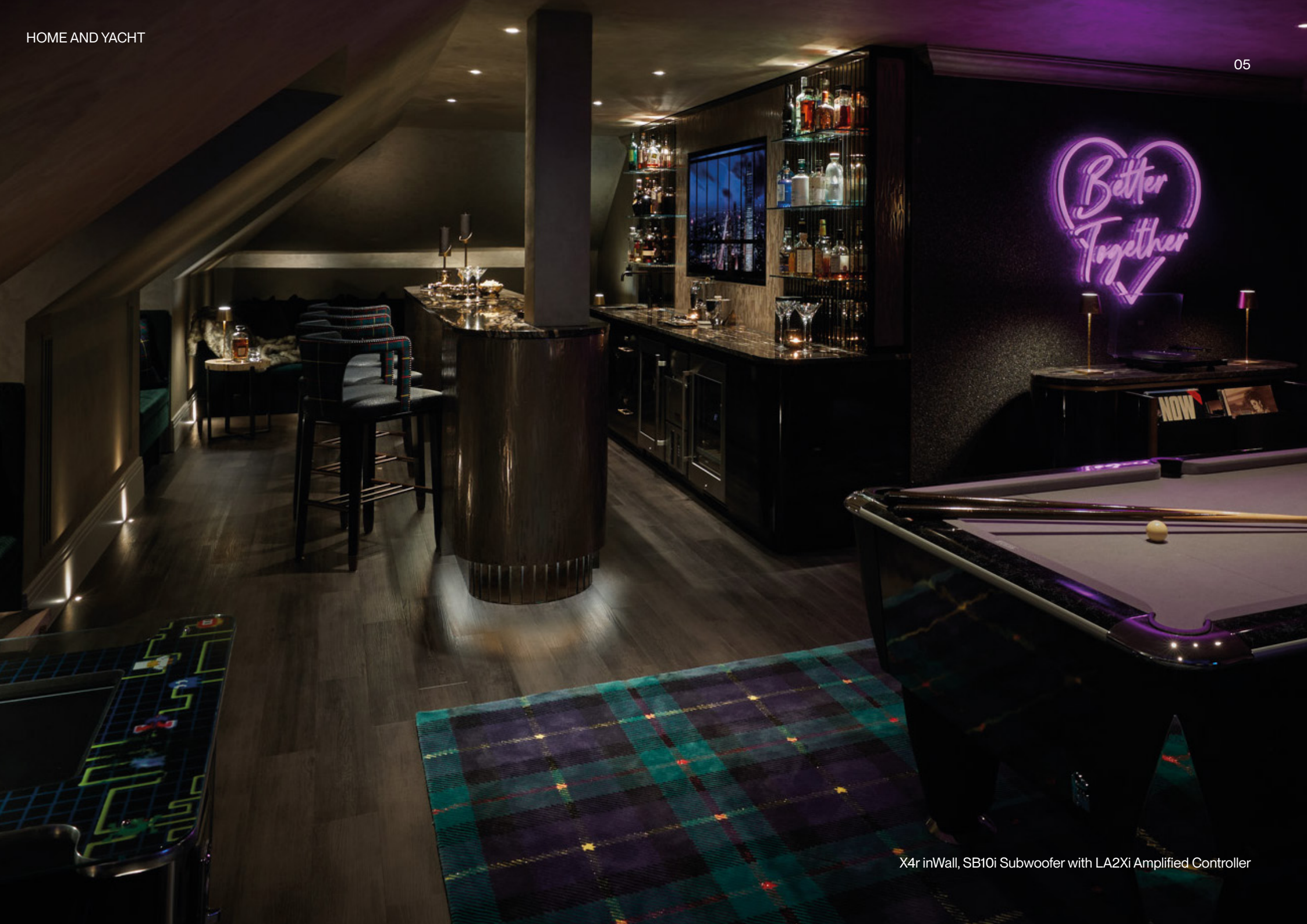
X4r inWall, SB10i Subwoofer with LA2Xi Amplified Controller