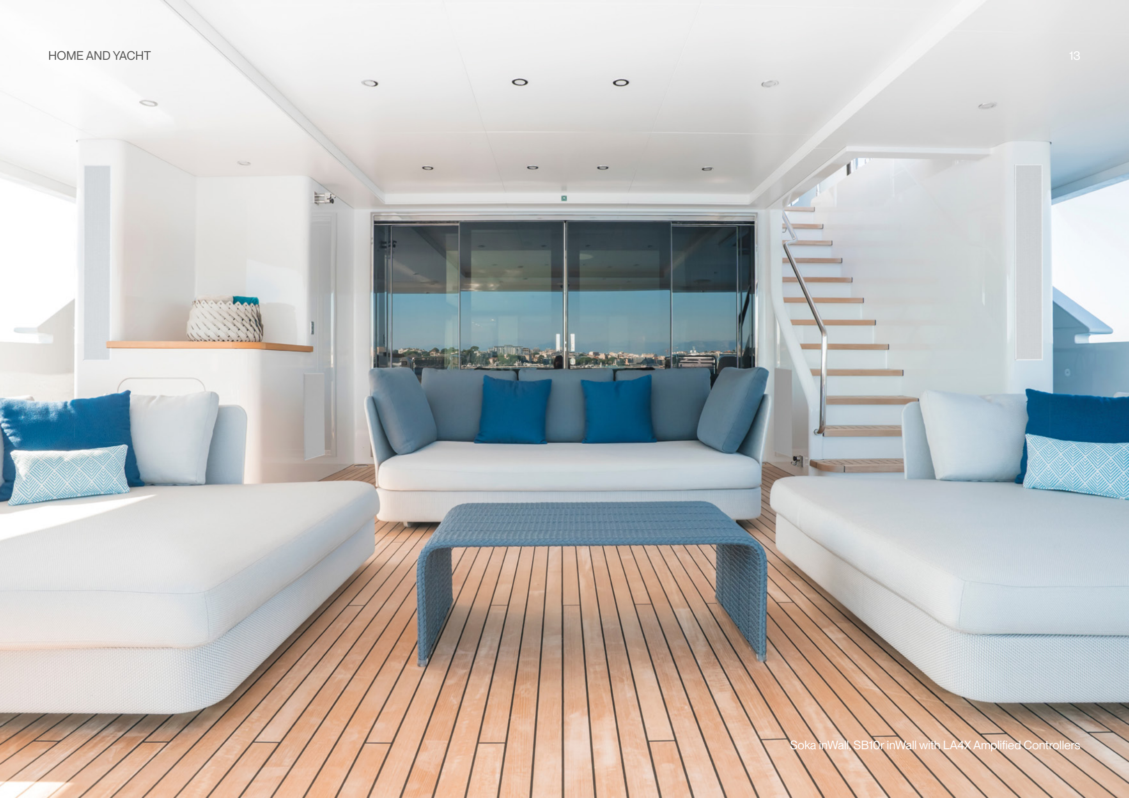
Soka inWall, SB10r inWall with LA4X Amplified Controllers