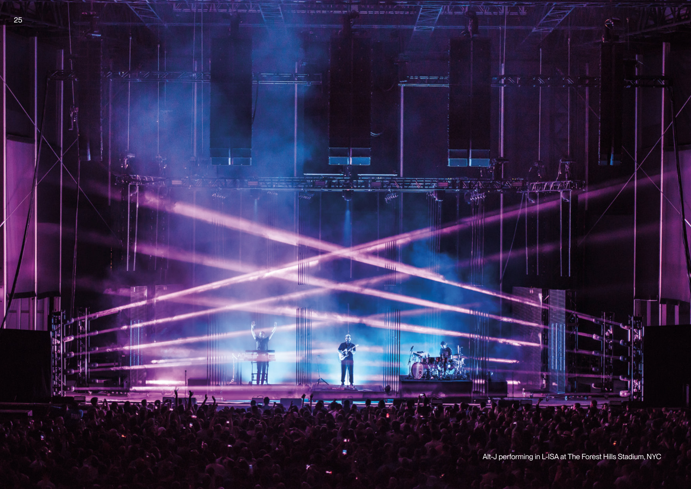
Alt-J performing in L-ISA at The Forest Hills Stadium, NYC