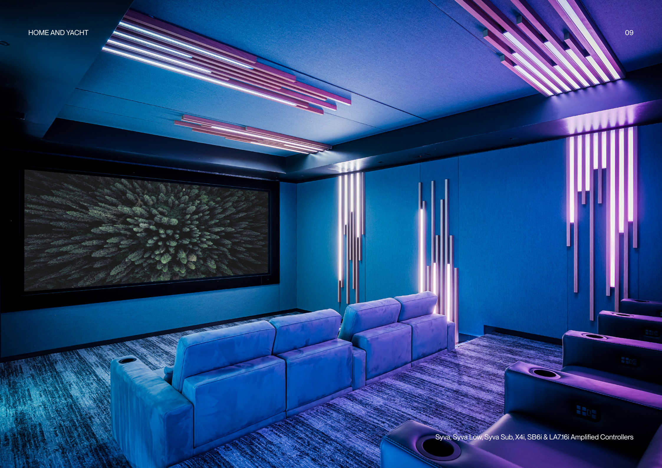
Syva, Syva Low, Syva Sub, X4i, SB6i & LA716i Amplified Controllers