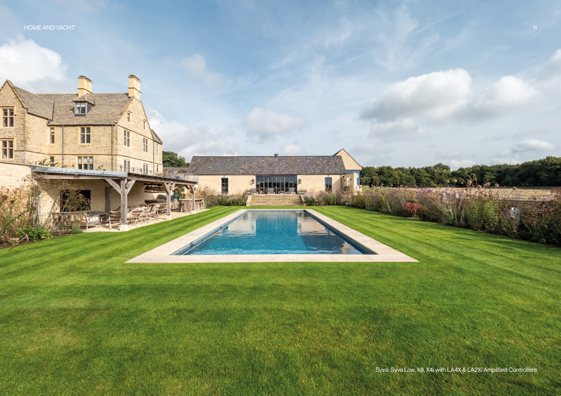
Syva, Syva Low, X8, X4i with LA4X & LA2Xi Amplified Controllers